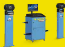
JUMBO 3D OPTIMA

Can be UPGRADED from Sequential alignment (one by one) to Simultaneous alignment (at a time) of all 5 axles / 6 axles .