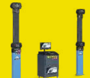
JUMBO 3D SUPER

Can be UPGRADED from Sequential alignment (one by one) to Simultaneous alignment (at a time) of all 5 axles / 6 axles .