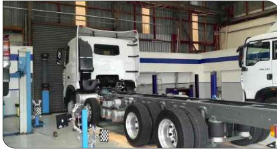
Auckland, NEW ZEALAND